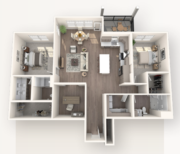
THE BIRCH TWO-BEDROOM PLUS DEN 1,590 Sq. Ft.