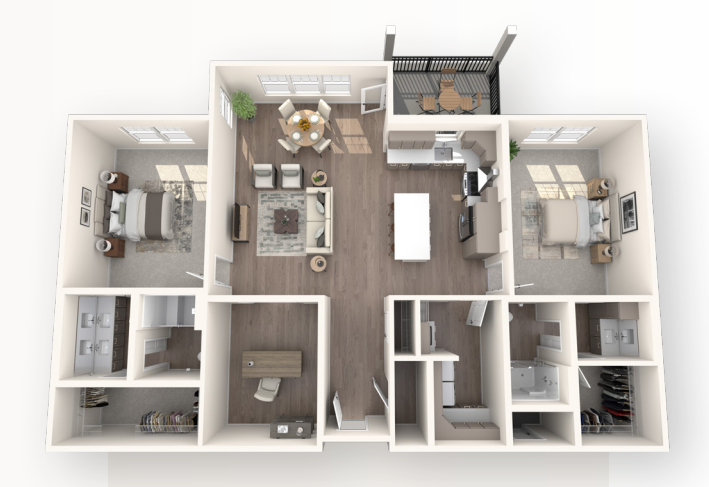
THE HICKORY TWO-BEDROOM PLUS DEN 1,740 Sq. Ft.