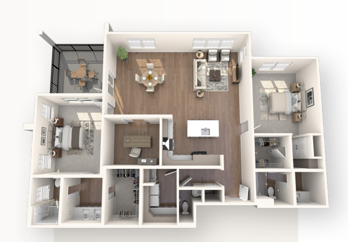
THE OAK TWO-BEDROOM PLUS DEN 1,900 Sq. Ft.