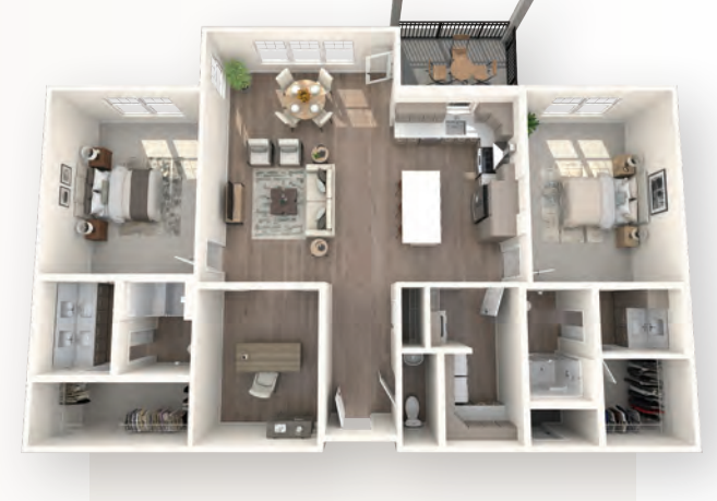
THE HICKORY TWO-BEDROOM PLUS DEN 1,740 Sq. Ft.