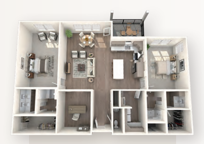
THE MAPLE TWO-BEDROOM PLUS DEN 1,820 Sq. Ft.