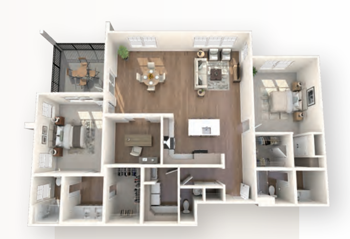
THE OAK TWO-BEDROOM PLUS DEN 1,900 Sq. Ft.