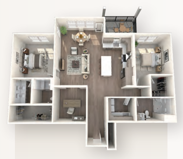
THE BIRCH TWO-BEDROOM PLUS DEN 1,590 Sq. Ft.